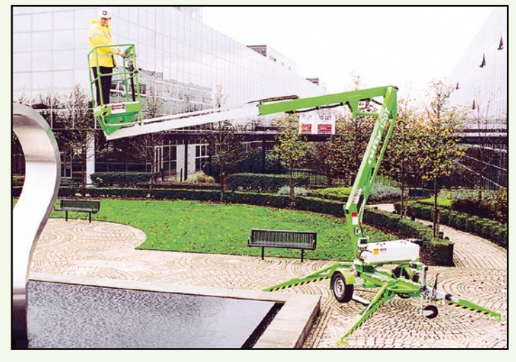
The telescopic boom provides outstanding working outreach especially at lower levels where it's needed most.

Due to a policy of continuing development and improvement, Niftylift reserves the right to change any specification without notice. Please confirm exact specification before ordering.